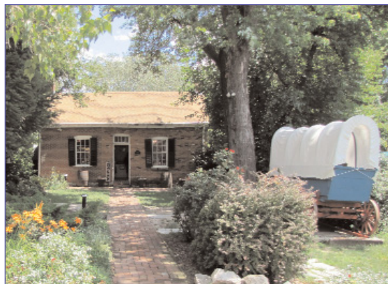
906 S. Main Street, archaeological site of the homestead of the town founder of St. Charles, ca. 1769.