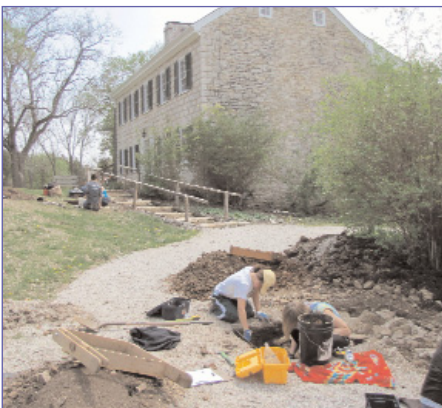
Archaeological work with the Boone Home in the background, 2011.