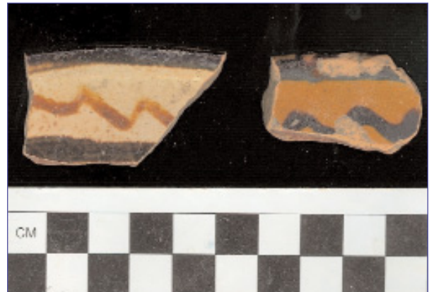
Slip-trailed redware deep plate rims.