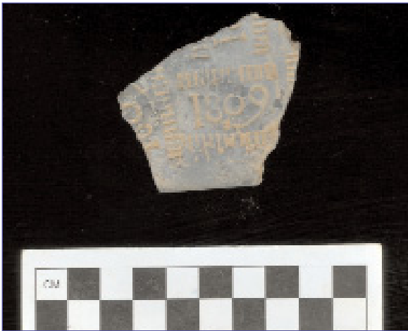
Redware tile stamped with date of 1809.

interaction on a personal level. I did not return to Kentucky with all of the answers to my questions concerning the redware produced by Conrad, but I am now equipped to find those answers in the invaluable contacts formed at this very enjoyable workshop. Contact me through the Corn Island website if you'd like more information ( www.ciarchaeology.com ).