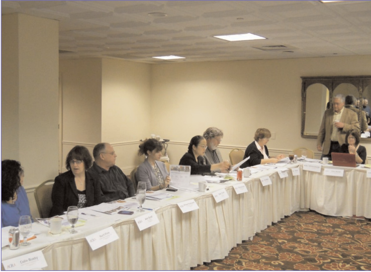
Part of the board at the 2011 Spring board meeting.

Please note that there is a write-in slot on the ballot. If a group of you have another candidate for the board or for officer, get together and run a write-in campaign. This is a perfectly acceptable approach.