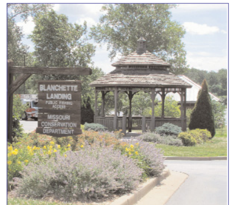
Scene along the KATY Trail in northern St. Charles, about 3 miles from the conference venue.