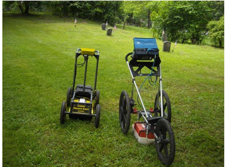
GPR equipment used in the investigation of a nonactive military cemetery.

For GPR use on cemeteries, including family cemeteries on Army lands, the ANMC will consider exceptions to the moratorium on a case-by-case basis. An exception request would need to be prepared by the base cultural resource manager (CRM) and submitted through the installation's chain of command to the executive director of the ANMC. LTC Ahern