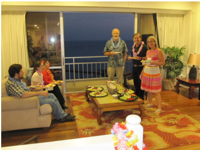
Guests enjoying the ACRA-CHP-SRI reception at the SAAs.