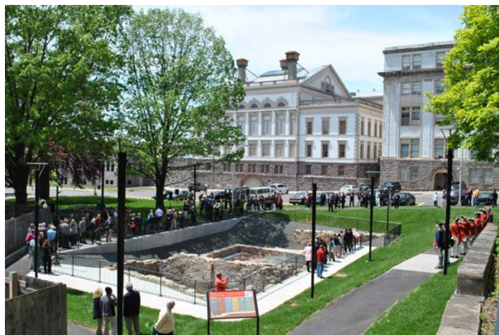
The preserved Petty's Run site and signage, with the New Jersey State House in the background.