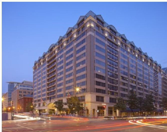
Grand Hyatt Washington, D.C., will be the host hotel for the ACRA/CLE International Conference.