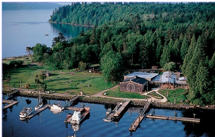
At Tillicum Village, conference attendees will enjoy a traditional Northwest Coast salmon bake.

The Seattle area is known for our many Native cultures, including the Suquamish and Duwamish Indian Tribes. This year, the conference planners are proud to announce that the Saturday evening dinner