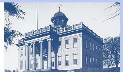
The University of Washington building in 1909, before it became the present day Fairmont Olympic Hotel. University of Washington Libraries, Special Collections, UW 957

Fairmont Olympic Hotel Seattle, Washington September 6-9, 2012