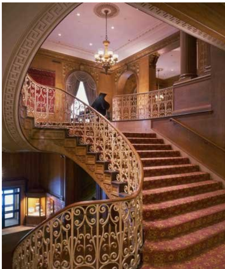
The grand staircase at the Fairmont Olympic Hotel in Seattle.

This year's conference will be held at the