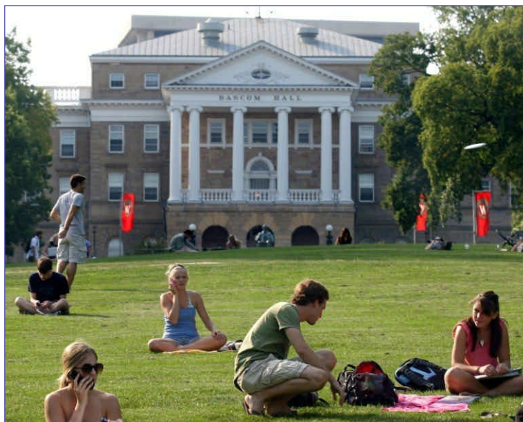
The afternoon tour will highlight cultural resources on the University of Wisconsin-Madison campus.

And what about all those papers and boxes at the office you just don't know what to do with? This year we will offer solutions to archive both your firm's history and ensure the history of our profession is available into the future.