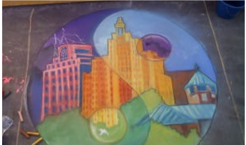
A street artist's rendition of downtown Providence, the site of this year's Annual Meeting - September 16 - 20, 2009.