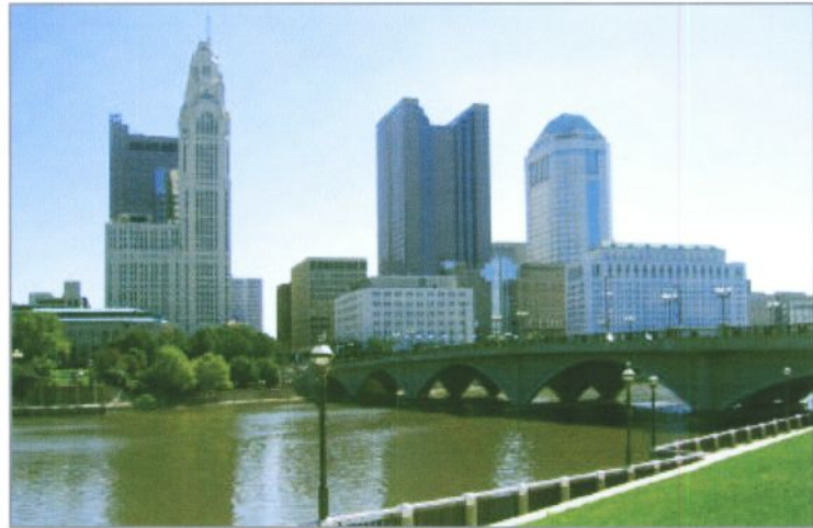
Skyline view of Columbus, Ohio: the site of the 2006 ACRA Conference hosted by Hardlines Design Company September 7-10.