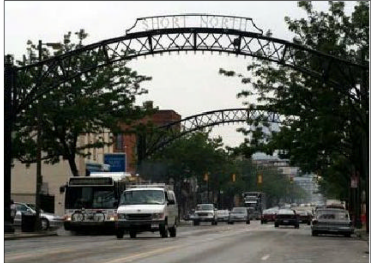
View of the Short North