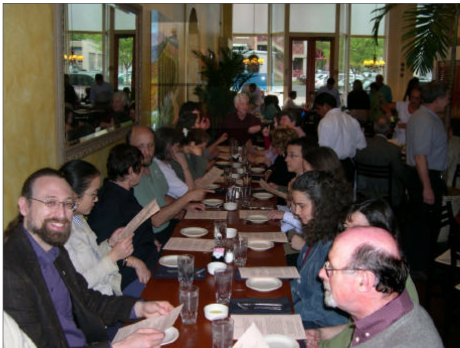
Board Members Enjoy Dinner at Cafe Luna.

The Executive Secretary, first and foremost, assists the President and the Board in the smooth functioning of ACRA. The Executive Secretary takes care of the mundane tasks of collecting the mail, moderating Members Only and ACRA-L. He (or she) also holds onto the conference display and carries or sends it to conferences. The Executive Secretary is also the point of contact for members and the public. I handle simple things, such as answering questions on how to get into the members section of the web site or directing people to the information about ACRA for which they are looking. Anything of substance gets sent along to the appropriate person, whether that is the President, a committee chair, the Board, or one or more of the officers. What the Executive Secretary does not do is make decisions for ACRA. All decisions are made by the President, the Executive Committee, and the Board. Under the current structure, the Executive Secretary is an assistant first to the President and then to the board.