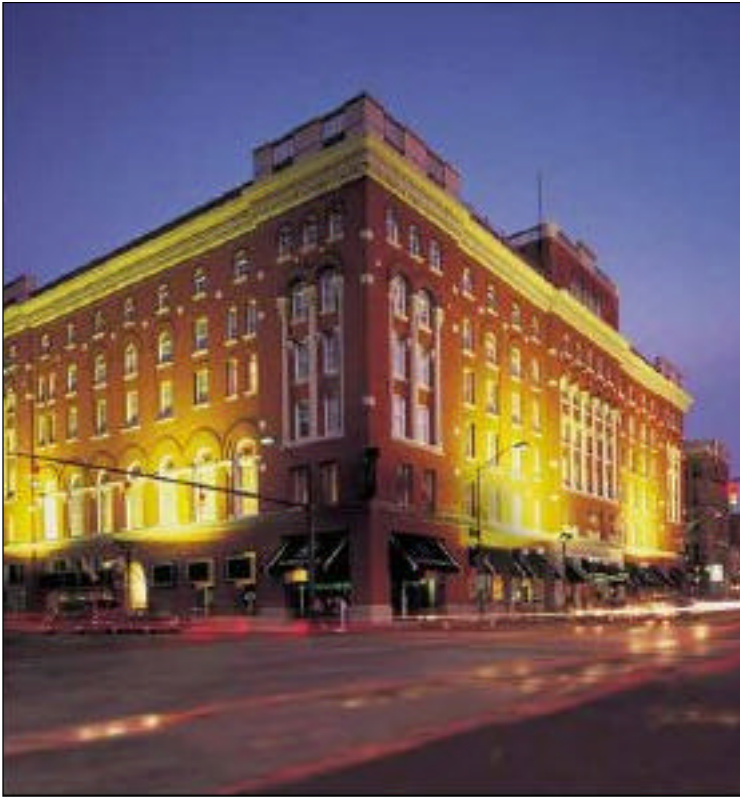
Exterior view of hotel

From exquisite architectural detailing and Queen Anne-style furnishings to original stained-glass windows and beautiful chandeliers, special touches throughout remind guests that history itself provided the inspiration for this stately hotel.