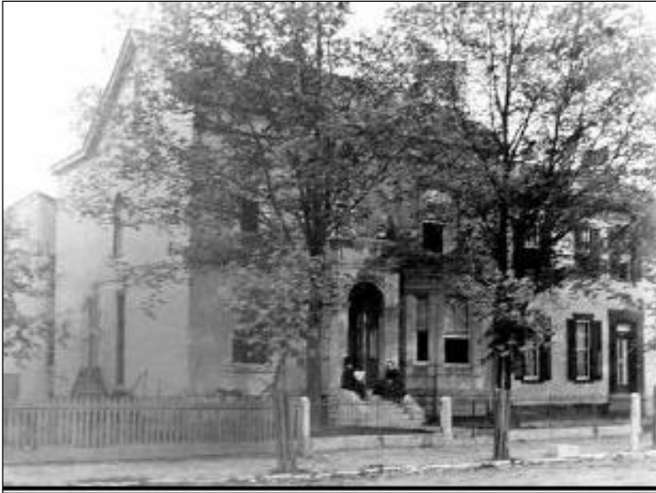
Historic photo of Kelton House