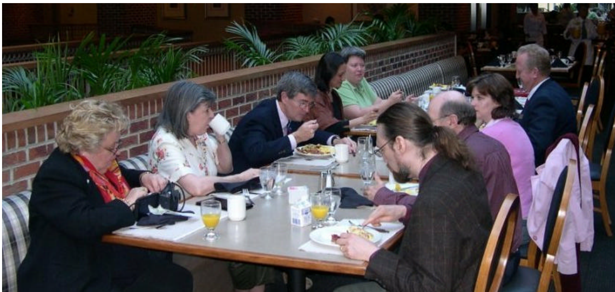
ACRA Board at breakfast meeting with Congressman Brad Miller (D-NC).

Thanks to Representative Miller and his staff for fitting us in to his very busy schedule.