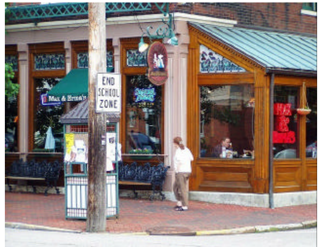
Max & Erma's - A German Village Pub