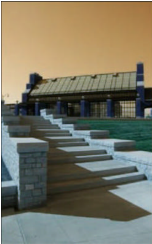
North Bank Pavilion

Other options we are looking into include the North Bank Pavillion, which has a great view of the river; Schmidt's Sausage Haus, a Columbus institution in historic German Village, and possibly a location in the Short North (where the art galleries are) or the Arena District (where the professional hockey team plays), both located near a lot of bars!