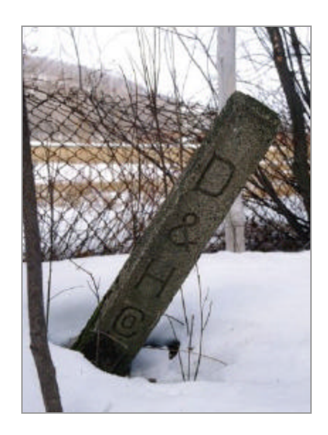
One of the railroad markers donated to local historical societies.

ACRA Lapel Pins are available to employees of member firms for $3 each. ACRA ACRA 6150 East Ponce de Leon Ave Stone Mountain, GA 30083 Make checks payable to: The American Cultural Resources Association